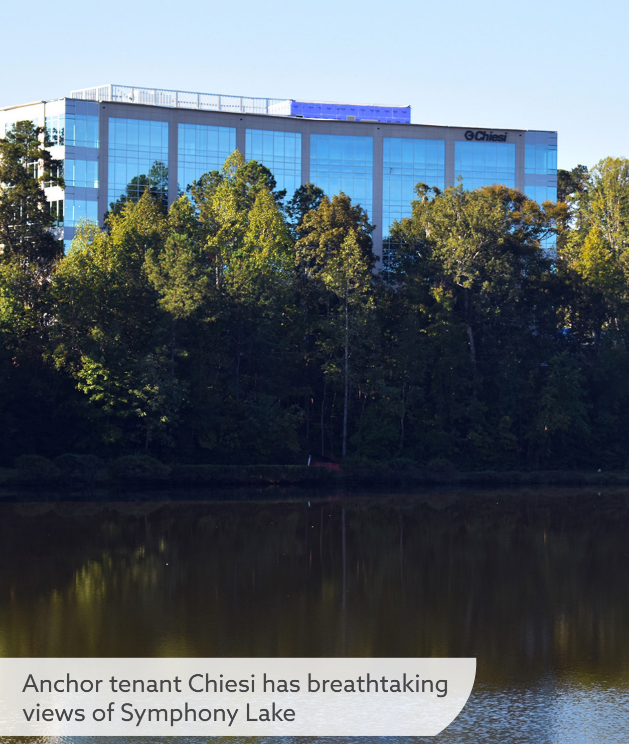
Anchor tenant Chiesi has breathtaking views of Symphony Lake