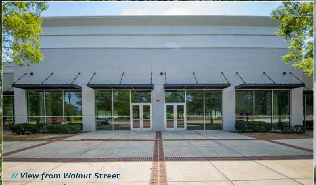
// View from Walnut Street